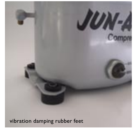
vibration damping rubber feet