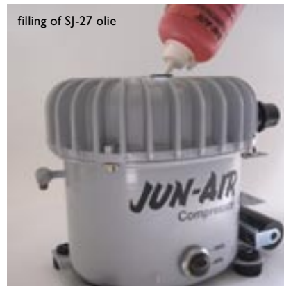
filling of SJ-27 olie